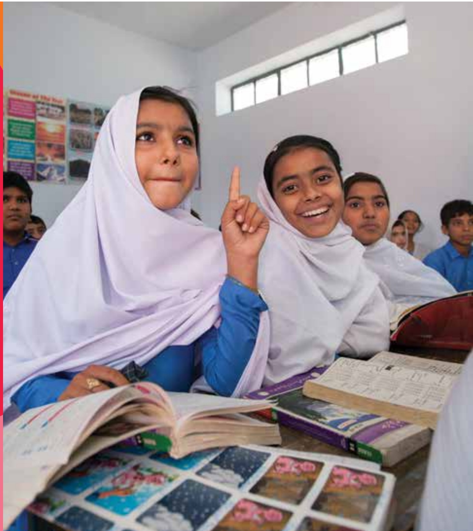
PHOTO: A sixth-grade Oxfam scholarship recipient from a primary school in Muzzafargarh, Pakistan, raises her hand in class. Read about girls like her on page 6.

Use the enclosed envelope or make your gift at oxf.am/closeup-partners .