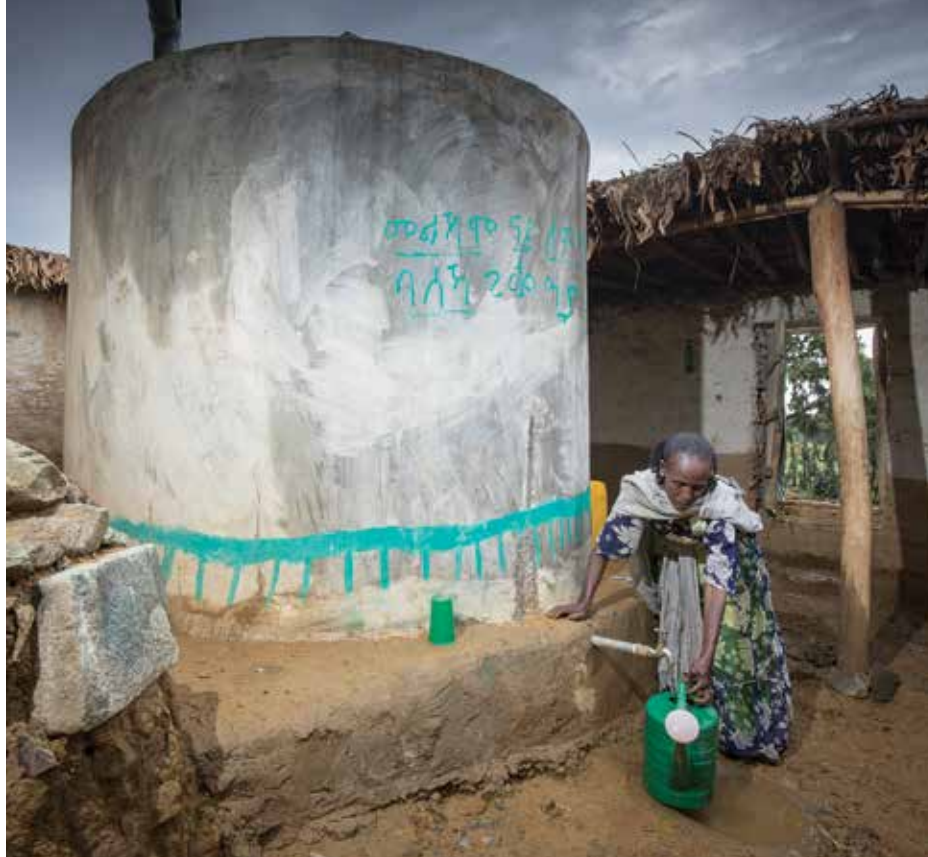
LEFT: Hagosa Demowez's 7,000-liter water tank catches rainwater from the roof—water she uses daily but also saves for dry seasons.