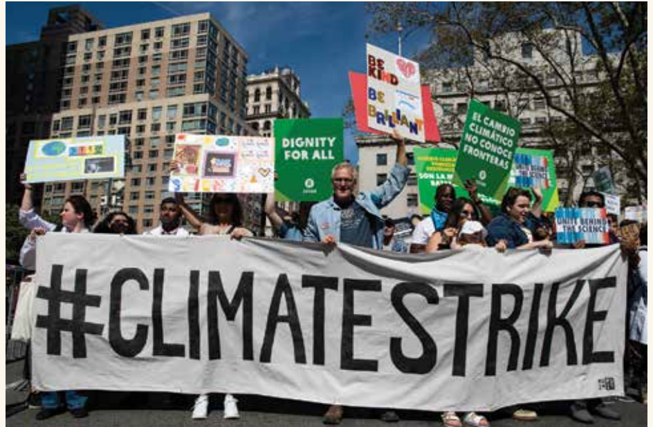
Oxfam participated in numerous climate strikes around the world in September, including this one in New York.

Dignity for women. Across the world, women are disproportionately affected by violence, discrimination, food insecurity, and climate change, which continue to drive the cycle of poverty. When we help women, we help humanity. Justice for women means justice for all.